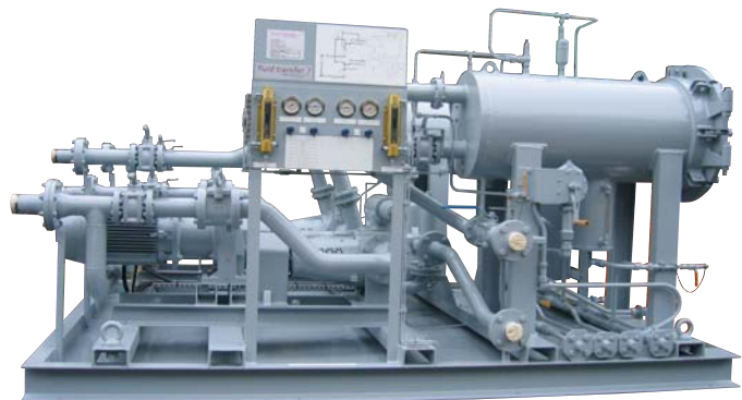
Helicopter Refuelling - Filtration and Pumping Skid