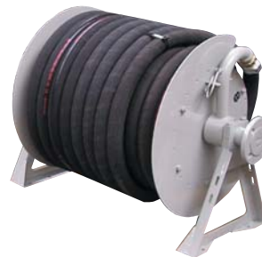
Manual Rewind Hosereel

Fluid Transfer International use Lloyds and NATO approved equipment, together with in-house manufactured equipment that has been used extensively on Helicopter refuelling systems supplied to the Royal Navy.